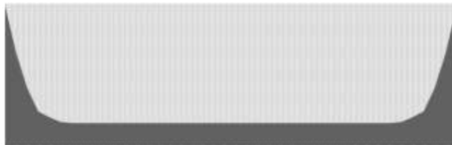
Fig. 1. Bath tube curve.

ically changing needs. The basic idea behind the Internet of Things (IoT) initiatives is to make the push of the communication of the various systems including cyber physical systems towards a common way exactly as nodes are interconnected over the Internet. This means a lot more than "every system should have an IP address". This approach allows access to all sorts of methods and technologies already common in the world of Internet, including advanced security methods, resource sharing, etc. and not to forget cloud-based solutions, and big data analytics.