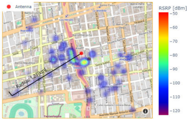
Fig. 3. RSRP measurement campaign conducted in a central neighborhood in Santiago, Chile. Latitude and longitude of the NB-IoT base station: -33.451392, -70.657928.

Furthermore, it is essential to recognize that this study focuses mainly on the downlink since the evaluated KPIs are defined for this link. However, for the uplink, the measurement values and trends are expected to differ by a constant offset since the only significant difference lies in the device's lower transmit power and the base station's higher sensitivity to the transmitted signal.