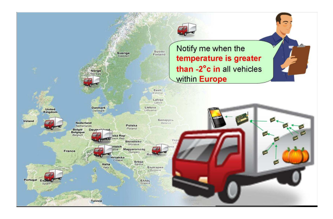
Fig. 1. A typical query in the fleet management scenario

Typically, a fleet management company provides clients (food companies in this scenario) with a fleet administration tool which allows clients to make a range of queries against vehicles transporting their load. Each vehicle, shown in Figure 1, may be connected to the fleet administration tool via a 3G internet connection, and each vehicle administers its own wireless sensor network, which is monitoring the vehicle's load. For larger companies, they may have several hundreds or even thousands (in the case of supermarket chains) WSNenabled vehicles transporting loads across Europe at any one time. A simple geospatial query requesting the location of all vehicles at a single point in time, would result in a very large and costly query being disseminated to potentially all of these vehicles. In this scenario, minimizing the financial cost of these queries is very important to the fleet administrators, and doing this in the presence of large scale systems is a challenge.